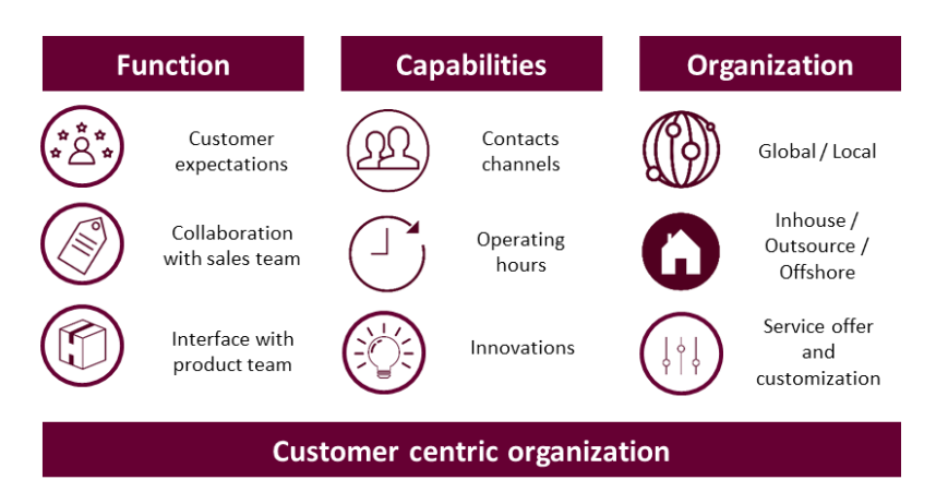
FIGURE 3: ADEQUATE PILLARS WHEN BUILDING A CUSTOMER SERVICE OFFER